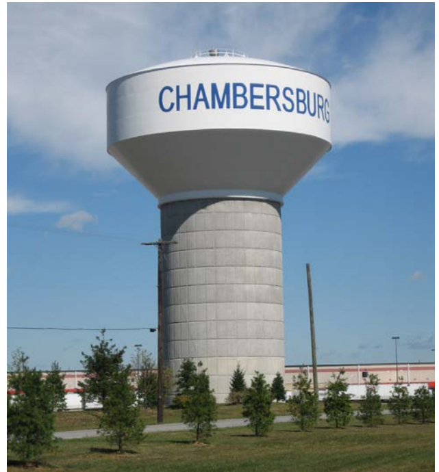
Figure 4: Nitterhouse Drive Elevated Tank